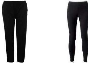
Black jogging bottoms or black leggings- outdoor