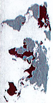
Victorian Empire (World)